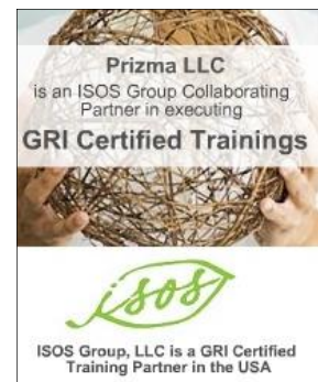
Prizma partnered with ISOS to expand GRI certified training opportunities

Prizma also continues to assist its clients with the successful development and desktop publishing of their inaugural sustainability reports. Please contact us here to discuss your sustainability training and reporting needs, or to co-sponsor/host GRI-certified courses.